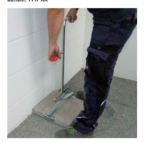
PPH-ERGO-HG with PPH-22/50