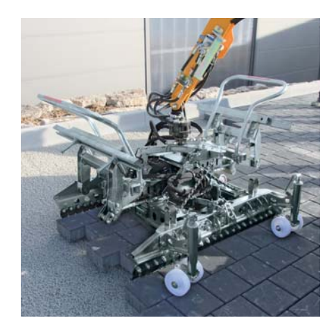
HVZ-UNI-II for VM-X/301/401/203/204