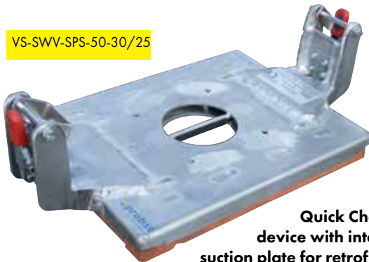
Quick Change device with integral suction plate for retrofitting for previous version