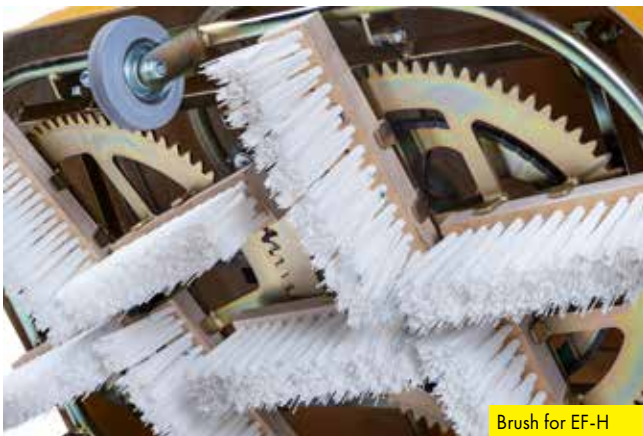
Brush for EF-H